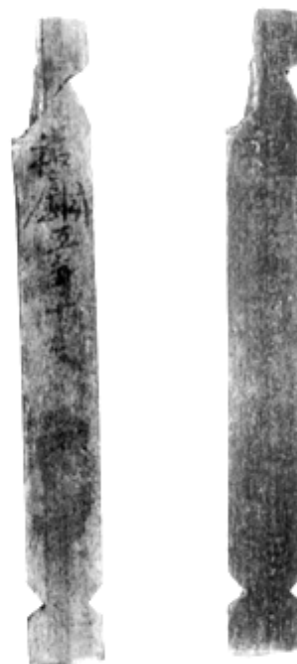
Fig. 4. Reflectgraphy of Wet Wooden-tablet Using an Infrared Vidicon Television System. (left :IR-image, right: normal)