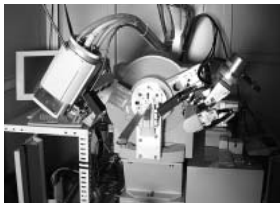
Fig.2. Non-destructive X-ray diffraction

However, radio-activation analysis and X-ray microanalysis, which make it possible to carry out qualitative and quantitative analyses on a quite small sample, are also often used. In addition, where the collection of a sample is permitted, atomic absorption spectroscopic analysis and plasma luminescent spectroscopic analysis are widely used to examine cultural