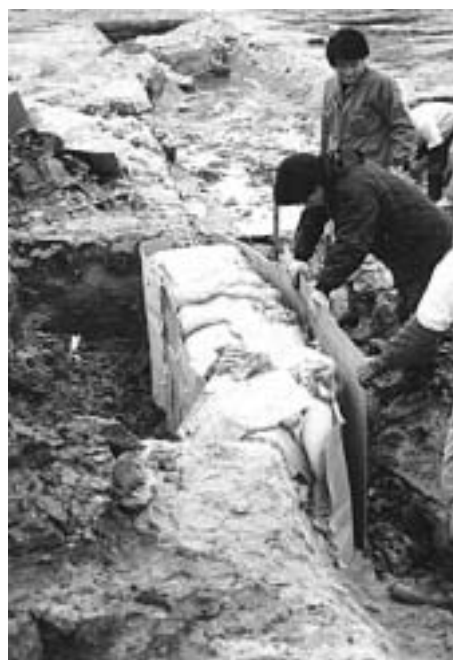
Fig.13. The wall, covered with Japanese paper or aluminium foil and in the cardboard box, are embedded in polyurethane form