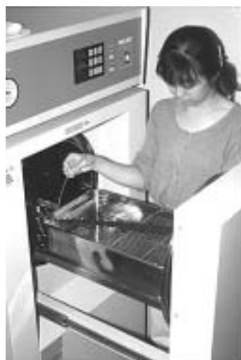
Fig.10. The High-temperature and high-pressure device. Chloride removal for iron.

Copper and bronze relics, as well as iron relics, corrode and degrade in the presence of chloride ions. For example, bronze mirrors that seemed stable when excavated, often corrode within a period of some few dozen odd years, and end up with degradation of the entire object. This phenomenon, when it occurs to bronze relics, is called “bronze disease”. Copper chloride or basic copper chloride is detected in the corrosion that develops on bronze relics. The non-destructive X-ray diffraction device with parallel beams can be used to obtain diffraction data about corrosion without damaging a precious cultural property, contributing to the early detection of bronze disease.