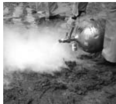
Fig.12. As for a Wet Organic objects, liquid nitrogen is applied.

Archaeological relics found during excavation are usually oxidized or decayed and so, if they are removed from the site as they are, their integrity might be destroyed. On the other hand, there are times when you cannot preserve them on site. In other circumstances too, it may be necessary to dig away the part of the soil layer or the shell layer that contains the relic and take it to the laboratory for detailed examination. Archaeological relics and structures removed from the site in these circumstances are often exhibited at museums or other educational institutions.