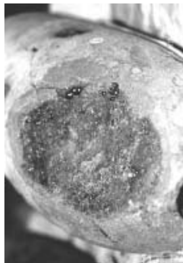
Fig.7. Iron rust has increased rapidly because the Iron cannon ball recovered from sea was naturally dried.

The study of metallic relics usually includes examining the techniques used to make them and the extent to which they have corroded. X-ray radiography has long been used for these purposes. This method was first used in Japan in 1935, to examine a glass pillow made of glass beads, when the relic was excavated from the Abuyama-Tumulus in Osaka Prefecture. Later, in 1978, a sword was excavated from the Inariyama-Tumulus in Saitama Prefecture. This method was used with great success to decipher a 115-character inscription written in gold inlay on that sword. Since that time, the use of X-ray radiography has spread rapidly in the study of buried cultural properties.