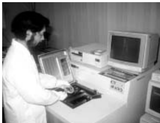
Fig.1 X-ray fluorescent spectrometer

Non-destructive methods for studying inorganic relics include fluorescent X-ray analysis, PIXE analysis and radio-activation analysis. Fluorescent X-ray analysis is carried out in the following manner. The sample is irradiated by primary excitation X-rays. Consequently, the sample generates characteristic X-rays peculiar to the elements it contains. The elements contained in the sample are identified from their place in the X-ray spectrum and their energy. Furthermore, a quantitative analysis can be made, by measuring the intensity of the X-rays. The devices used for this research are usually modifications of standard devices, which vary widely in size and shape. Fluorescent X-ray analysis is the most widely used investigative technique at present (fig.1).