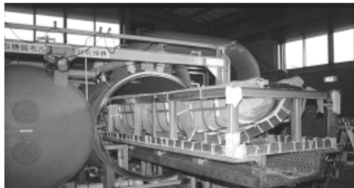
Fig.6. The large freeze-drying unit. (Conservation of loq-boat, 5m long)