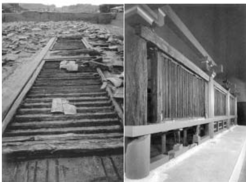
Fig.3. Left: A Japanese muntins window excavated at Yamadadera site in Sakurai, Nara prefecture, and a part of the temple left falling down was discovered with enormous quantities of building materials of wood. All the waterlogged wood from this site have been treated by PEG methods. Right: The reconstructing a part of Yamadadera temple in the museum, using the conservation-treated waterlogged wood.

Excavated organic relics are examined from various aspects and treated to preserve them. One of the most popular research activities is deciphering characters written in Chinese ink on wooden tablets or lacquered paper. It is often necessary to read characters that cannot be seen with the naked eye (under visible light) by using an infrared-ray TV camera or an image