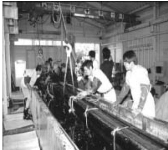
Fig.5 A large P.E.G. impregnation tank.

Recent excavations carried out in low marshy places yielded a large number of wooden relics. Since they had already been excavated and were therefore vulnerable to destruction, it was necessary to preserve them swiftly. It takes a long time to complete impregnation using the conventional PEG (quasi-polymer) method. Recently, various studies have been carried out with the aim of shortening the time required to complete impregnation by using especially permeating low-molecular-weight materials to reinforce waterlogged wood. The result has been successful in the impregnation of archaeological relics using higher alcohol or sugar alcohol. In the higher alcohol method relics are impregnated with cetyl or stearyl alcohol. Their molecular weights are so small to PEG that the impregnation time is substantially shortened. In addition, unlike PEG, they are not hygroscopic, and so the post-treatment storage of relics is made easier. It has also