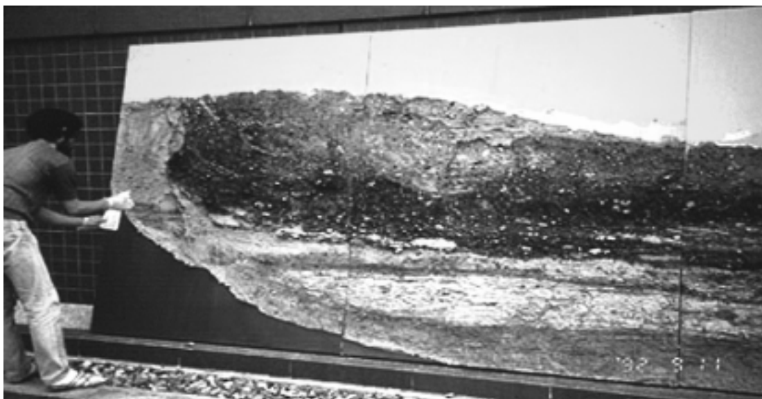
Film removal result displayed in a museum. Even heavy materials like potsherds can be fixed onto film