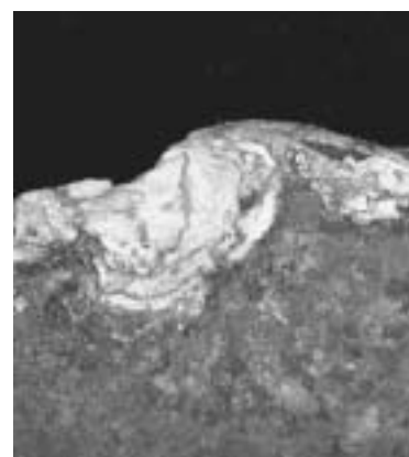
Fig.8. The bronze disease is formed with the chemical reaction of copper and the chloride ion.